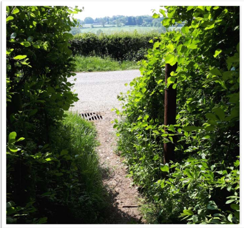
Photo 10: Picture of alleged Footpath C109a as it emerges out onto Oaks Road (south) at point 'D' on the plan.