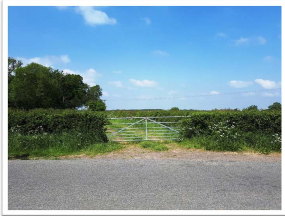
Photo 7: Looking back towards the field gate and entrance to alleged Footpath C109 from the opposite side of Oaks Road (north). At point 'C' on the plan.