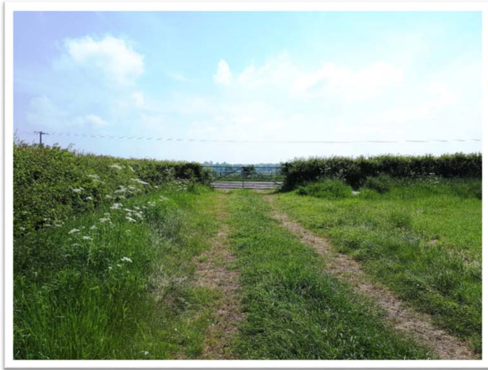
Photo 5: Looking along alleged Footpath C019 following the farm track towards the field gate out onto Oaks Road (north) at point 'C'.