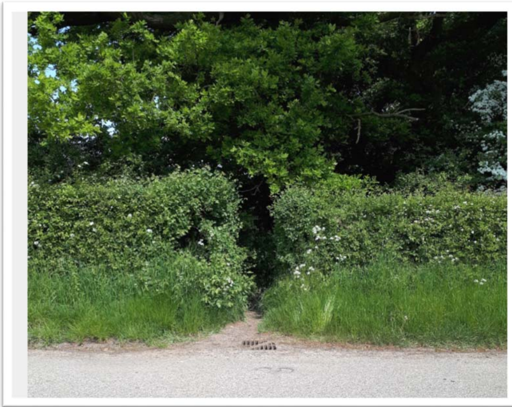
Photo 11: Emergence of alleged Footpath C109a onto Oaks Road (south) taken from opposite side of road at point 'D'.