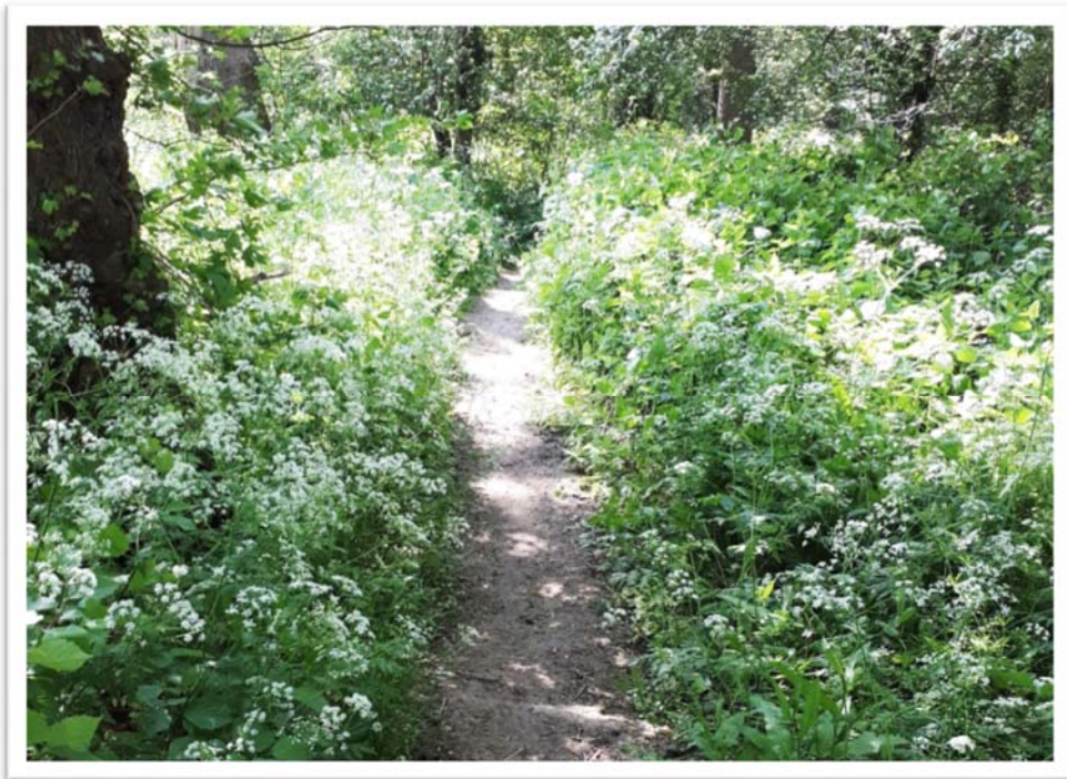
Photo: 8: Continuation of alleged Footpath C109a southwards through middle of Glen Oaks Spinney.