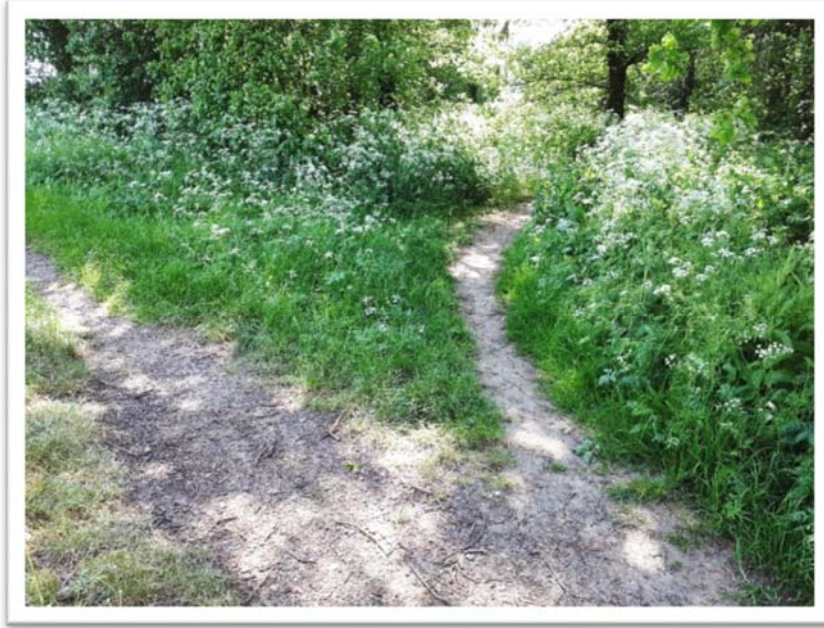
Photo 3: Photograph of junction of alleged Footpath C109 (foreground) and alleged footpath C109a (heading off into the woods. Taken from point 'B' on the map.