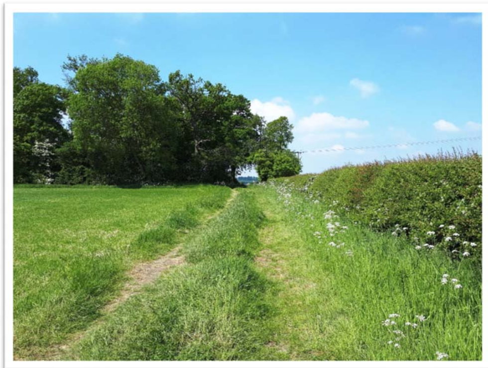
Photo 6: Looking back along the farm track towards the northern end of Glen Oaks Spinney.