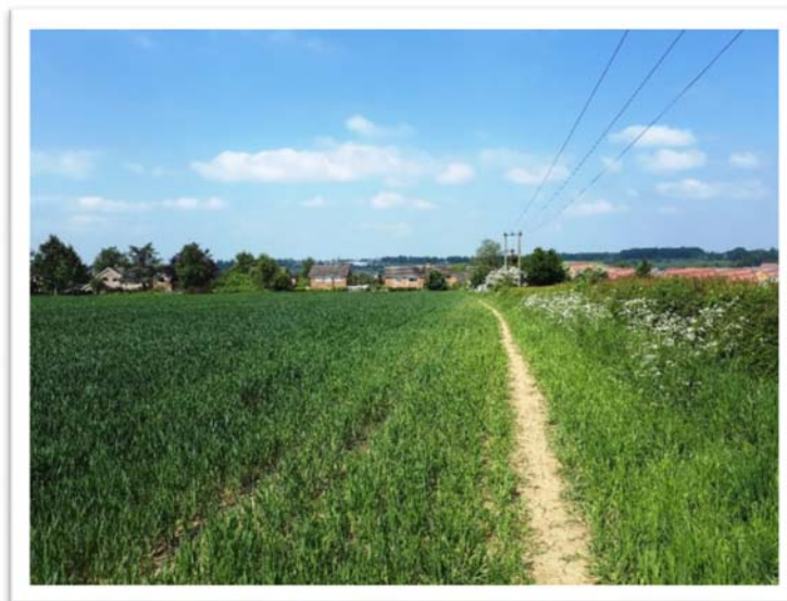
Photo 2: A view of the alleged footpath looking back along the headland towards Footpath C13 and Glenfield Village.